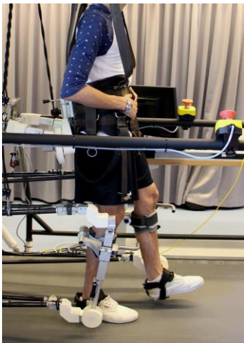
exoskeleton for balancing