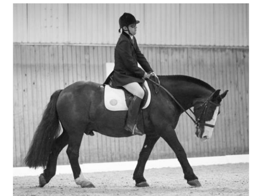
assistive technologies for sports