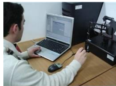
mobile robot teleoperation